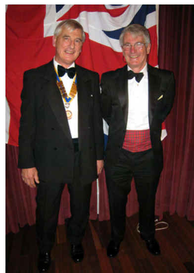
Would Nelson have made a good Rotarian?