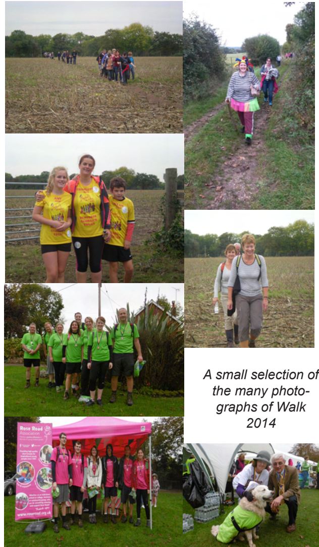
A small selection of the many photo- graphs of Walk 2014

P.S. By October 24th £30,000 of sponsorship had already been collected from the 2014 Walkers.