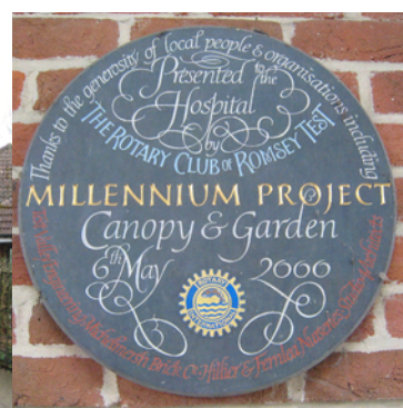
The hospital canopy, a lasting contribution to Romsey Life