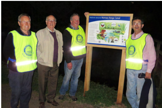
Some of the bat surveyors next to the wildlife information board.

Running north from the Plaza is the last identifiable stretch of a canal that once linked Andover to Southampton Water. The path alongside is a well-used footpath and the canal acts as a wildlife corridor into the heart of the town. Our Club with other partner organisations has been working to improve the Barge Canal as an amenity for the town.