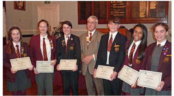
The audience and judges and the winning teams

The first, on February 11th was the Youth Speaks local eliminator featuring intermediate and senior teams from Mountbatten , Romsey and a senior team from Hampshire Collegiate school.